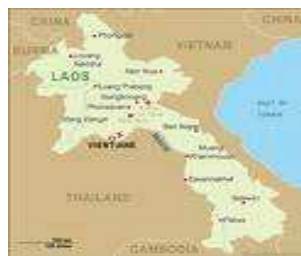
Map of Laos

My knowledge and experience with the Primary Years Programme (PYP) grows as I continue to implement the many